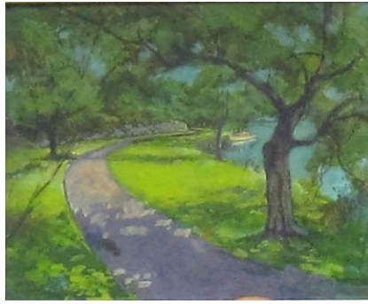
Ron Rasch Art- Scenic Path