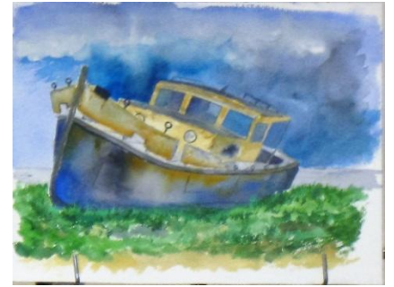
Pat Bailey Art- Boat in Seaweed