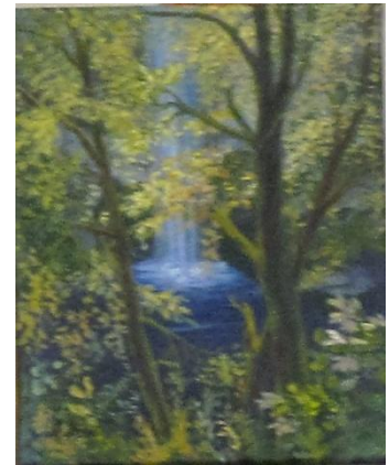
Diana Strom Art- Hidden Waterfall