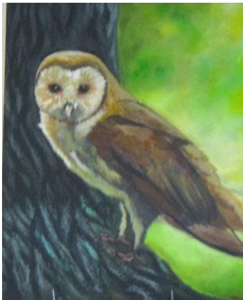
Guest Zora Art-Owl