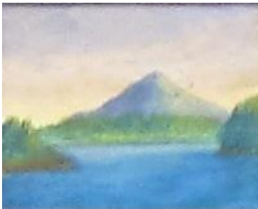
Gene Yates Art-Mountain Lake