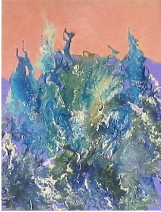
Linda Fields Art-Poured Acrylic