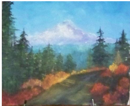
Dee Todd Art