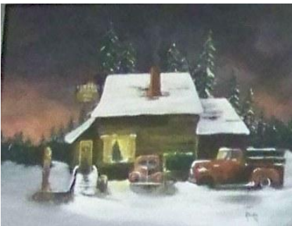
Rhoda Bohr Art