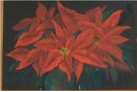
Patti Kraft Art