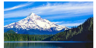
Clear skies again!

One reassuring thing about modern art is that things can't be as bad as they are painted.