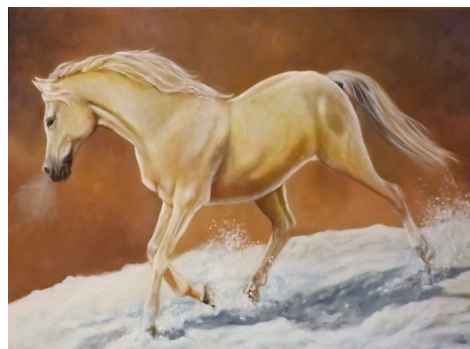
Sample of Syndi's Work website