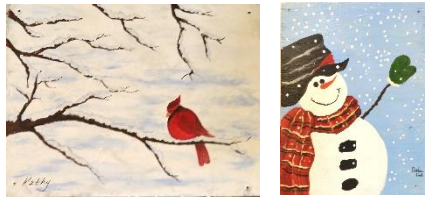
Oak Grove fence art: K Conrad, S Lind Not included in the Holiday Competition

Open to Northwest Artists of All Skill levels